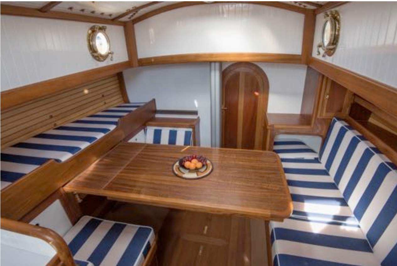
Dinette Table extended